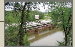
Little River Watershed Assoc.